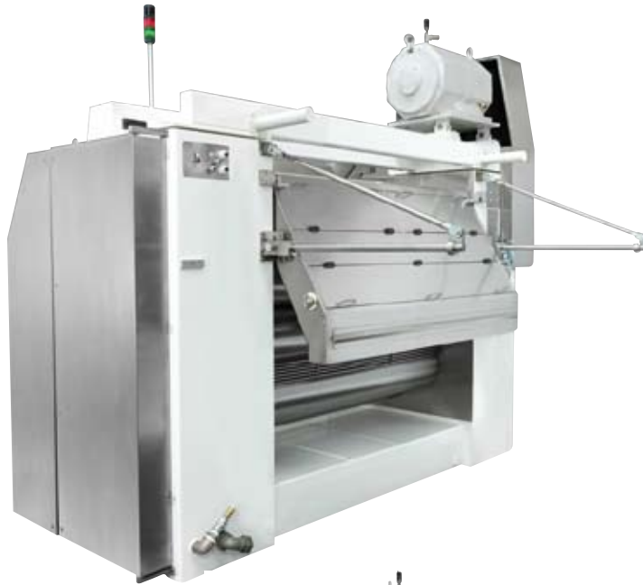
— 5-Roll Refining

Use the experience of more than 175 years in traditional chocolate manufacturing. Since then the company F.B. Lehmann has been one of the key players in the production and installation of turn-key chocolate production lines. Combining high technology machinery to create a turn-key line is a guarantee of high quality chocolate production under the most modern hygienic and safety aspects.