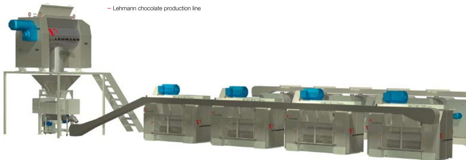
— Lehmann chocolate production line